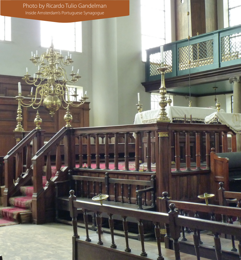
Inside Amsterdam's Portuguese Synagogue

Now, before I leave Amsterdam, let me say that it is a beautiful city that I would highly recommend to explore it as well. The Resistance Museum in the old Jewish Quarter and Ann Frank’s House were very powerful. I also visited the second oldest Synagogue in all of Europe. It is called the Portuguese Synagogue and is so old it has no heat and no electricity.