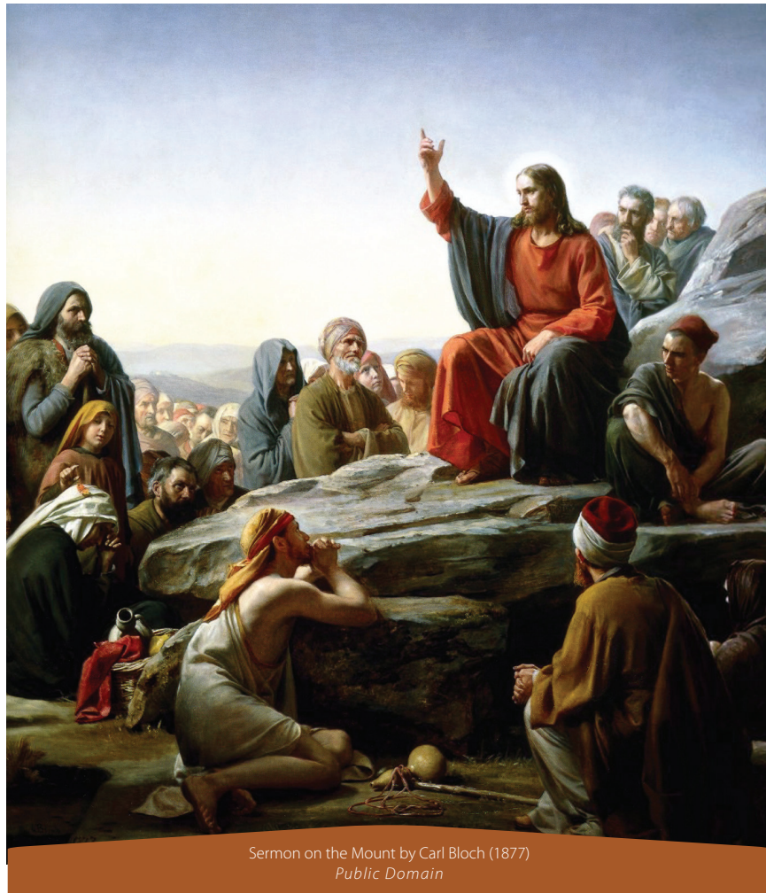
Sermon on the Mount by Carl Bloch (1877)

Christians, where is our love? If we want to be good evangelists for Christ, how can we be that when we have no love? Granted,