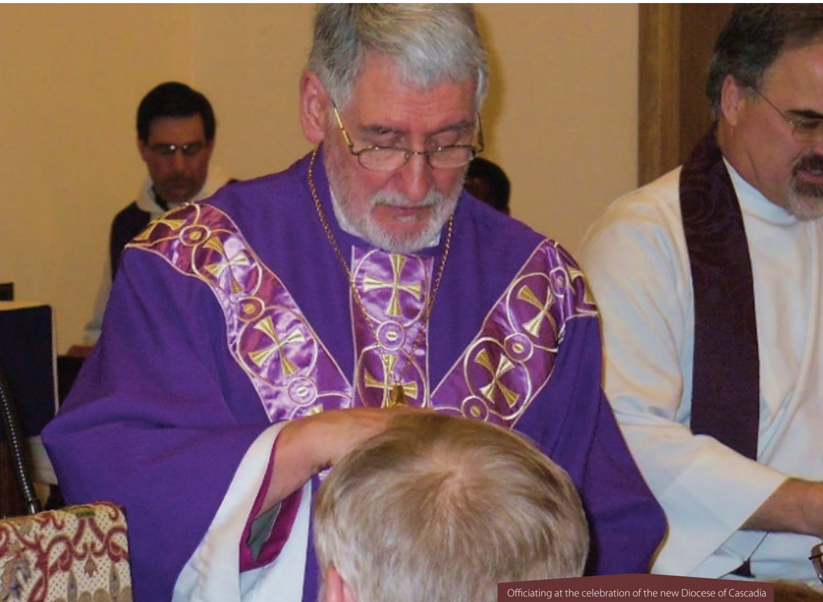
Officiating at the celebration of the new Diocese of Cascadia